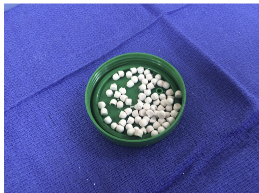
Fig. 4. Clinical photo of vancomycin/tobramycin-impregnated calcium sulfate beads.

Animal studies have evaluated the local and systemic levels of tobramycin after impregnated calcium sulfate beads are implanted into tissues. Local tobramycin levels have been found to rapidly rise over the first 24 hours, and then rapidly decline. Levels of tobramycin were found to still be therapeutic at 14 days after implantation. Some animal subjects, however, had elevated local tobramycin levels for at least 28 days. Serum levels, however, rose quickly and peaked during the first hour after implantation. Serum levels became undetectable after 24 hours. 112 In vitro testing has compared the elution of daptomycin and tobramycin from calcium sulfate beads. Similar to other studies, both antibiotics are rapidly released from the beads over the first 24 hours, followed by a rapid decline in the following days. However, after a 28-day period, the daptomycin-containing beads released only 35% of the total antibiotic incorporated into the beads, whereas 68% of the total tobramycin had been released. 113 Other in vitro studies have shown that the peak local concentration of vancomycin when eluted from calcium sulfate beads occurs 48 hours after implantation. 114 Other variations of calcium sulfate beads have been developed that elute