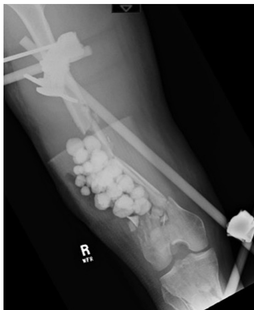
Fig. 2. Radiograph of patient with type IIIA open femur fracture treated initially with debridement and irrigation, placement of vancomycin/tobramycin-impregnated PMMA beads, and placement of external fixator.

Advantages of PMMA include its structural properties and space-filling capacity. These advantages are lacking in other forms of local antibiotic administration, such as antibiotic powder, aqueous solutions, gels, and collagen or chitosan sponges. Like many other forms of local